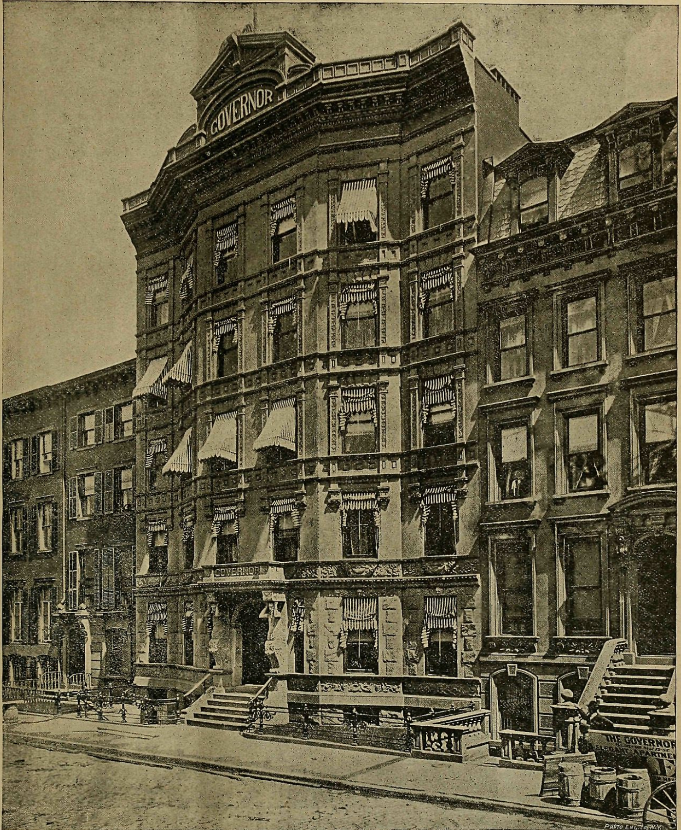
"THE GOVERNOR," 12TH STREET, BETWEEN 5TH AND 6TH AVENUES.

head of a former Governor of the State of New York. These heads represent Cleveland, Tilden, Cornell, Hoffman and—in the centre over the doorway—Governor Hill. An attractive feature of the building is the bay, which runs from basement to roof. This bay takes in one each of the two windows belonging to the side apartment and the two windows in the middle apartment, and on the one side 5th avenue can be seen and on the other side of the house 6th avenue. The vestibule is large, roomy and attractive, made so by panels of French decorated glass representing various pretty scenes. The hall, like the vestibule, is of comfortable proportions. On each side, as you go in, are large French plate mirrors, 7x11 feet in size, which give the hall an endless appearance.