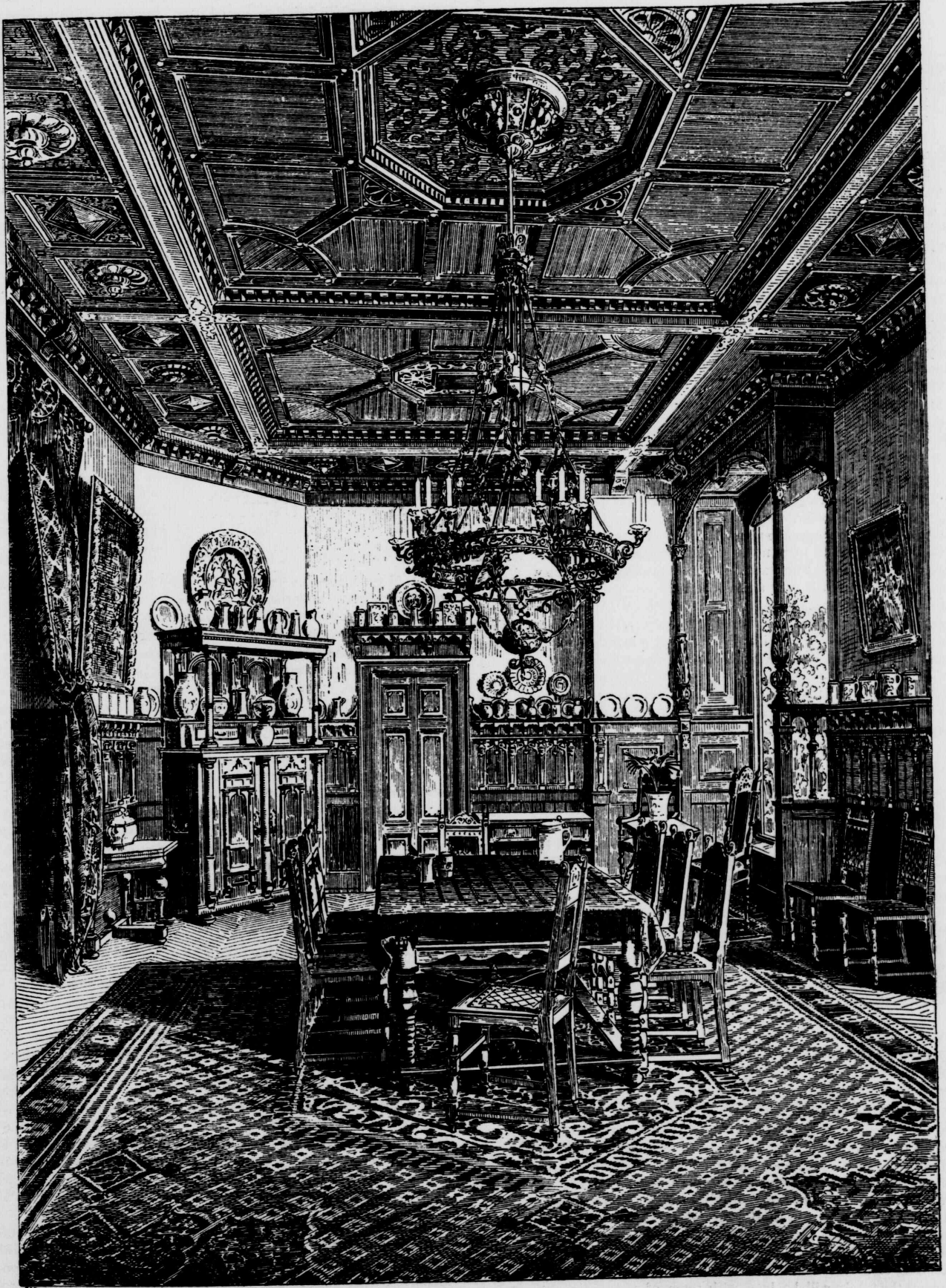
Dining-Room,—Villa Schwartz, 4 Lichtenstein Avenue, Berlin.