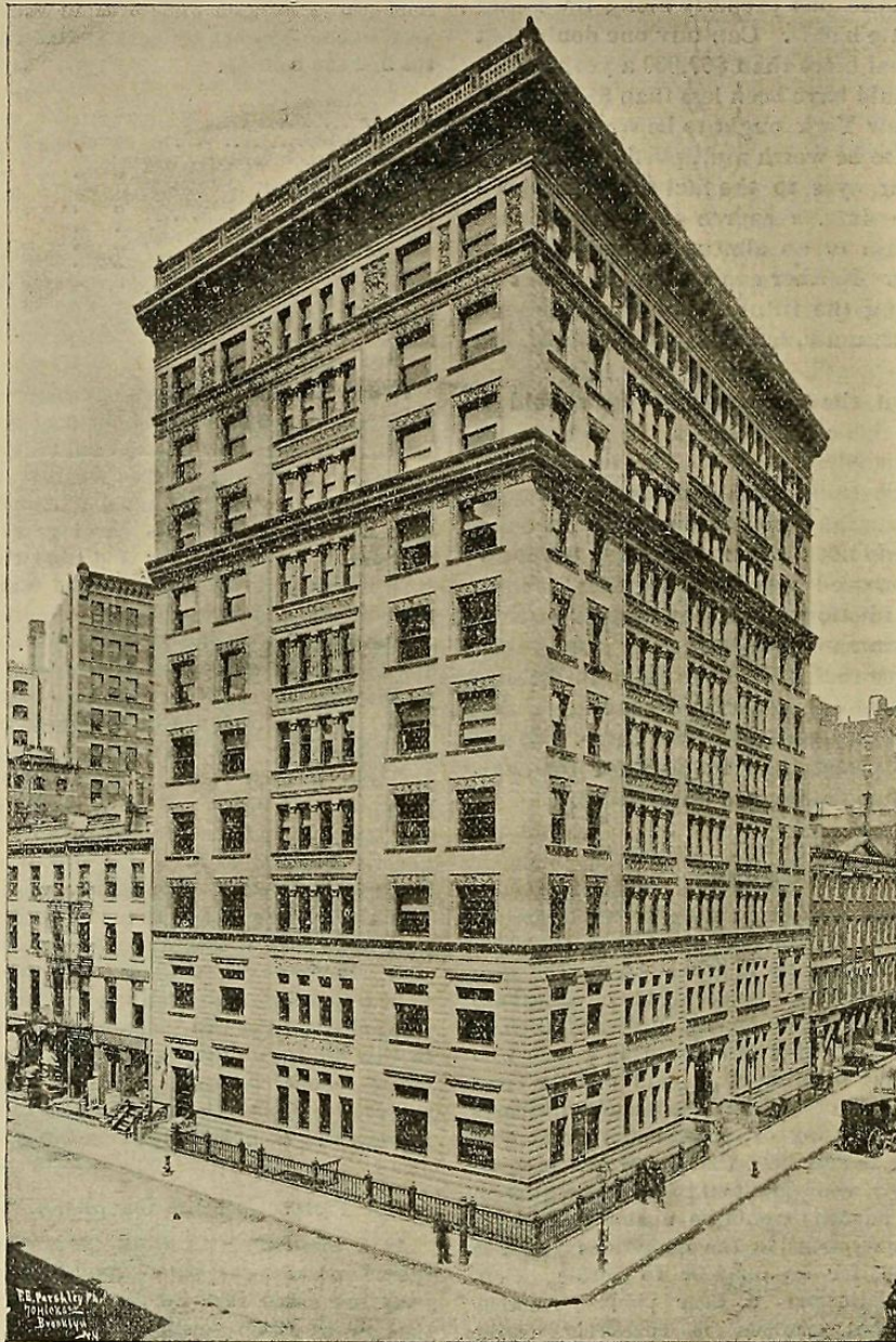
The Morris Building, corner Beaver and Broad Streets.

Passing through this entrance to the main hall, this is found also to be wainscoted with the same handsome patterns of Numidian marbles, constructed in style similar to that of the loggia. The side corridors also and the main staircase have the same style of wainscoting, and the bases of the columns in the banking office, that occupies the corner part of the first floor, are of Numidian marble. A peculiarity of all this work is the