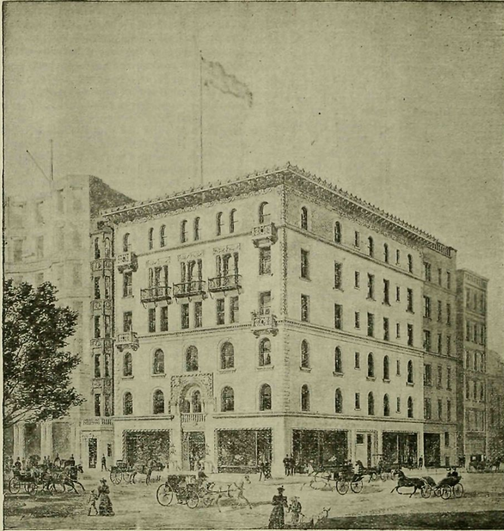
Fifth avenue and 58th street, N. Y. City.