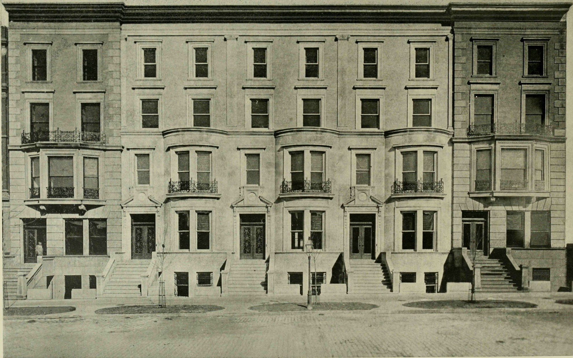
FIVE ELEGANT NEW DWELLINGS, Nos. 37 TO 45 WEST 86TH STREET, BETWEEN CENTRAL PARK WEST AND COLUMBUS AVENUE.

C. W. LUYSTER, Owner and Builder, 253 Columbus Ave., cor. 72d St.