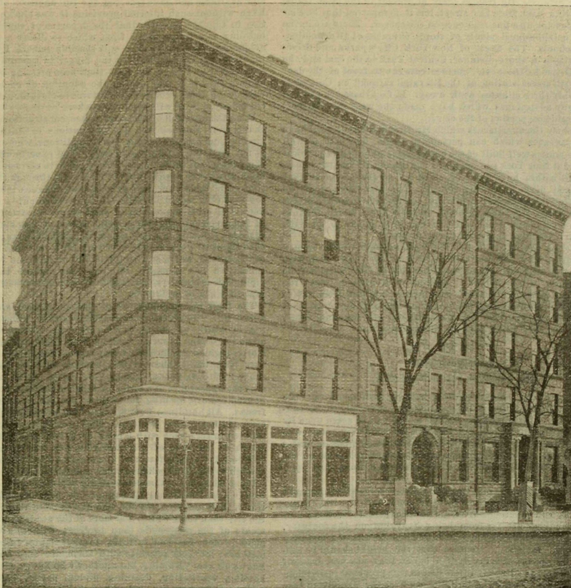
Three Apartment Houses on the Southeast Corner of One Hundred and Fifth Street and the Boulevard.