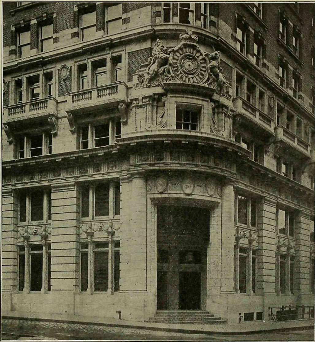
DETAIL OF ROYAL INSURANCE BUILDING.