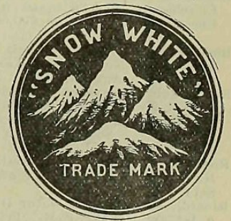
"SNOW WHITE" Portland Cement

Its pure white color, strength and close grained hardness, together with its hydraulic properties and its ability to withstand the elements, place it in a class by itself, unique in all its qualities, and indispensable at any price.